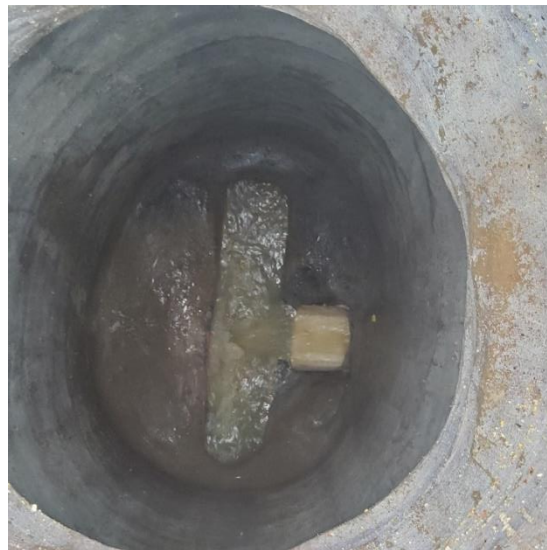
Cityworks Image: 20231210_113319.jpg