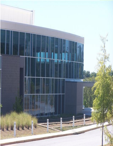
Porter Sanford III Performing Arts & Community Center