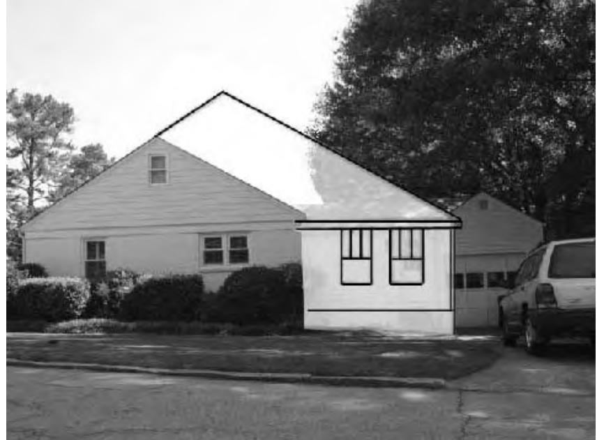
Poorly conceived addition that would mask the homes original proportions and character.

Recommendation — Place an addition at the rear of a building or set back from the front to minimize the visual impact on the original structure to allow the original proportions and character to remain prominent and to differentiate the old from the new.