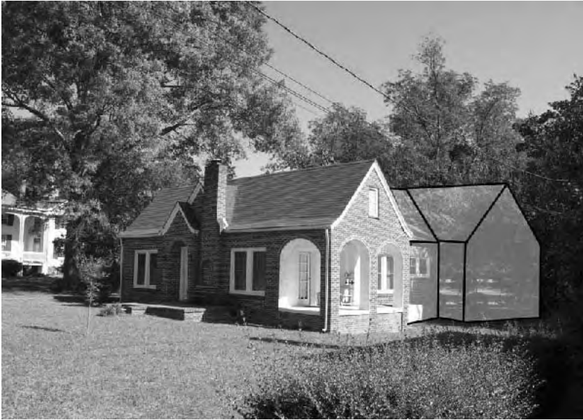
Well conceived addition that would substantially increase the size of the home while minimizing the appearance of the mass of the home. Breaking buildings into smaller architectural components avoids the perception of monumental façade.

Beside, the previous guidelines and recommendations and as an aid to current and future residents there are additional recommendations and examples that could aid one in the design of homes that are compatible with the current homes in Chelsea Heights. Creative new designs that are compatible with the design traditions of the established neighborhood are encouraged, whether there is a new building or a new addition. While it is not the intent to require that new buildings copy older building styles, the use of established building forms and patterns is likely to ease the process of gaining approval. Accordingly, new second story additions to homes including ranch style houses are acceptable when they comply with these Guidelines.