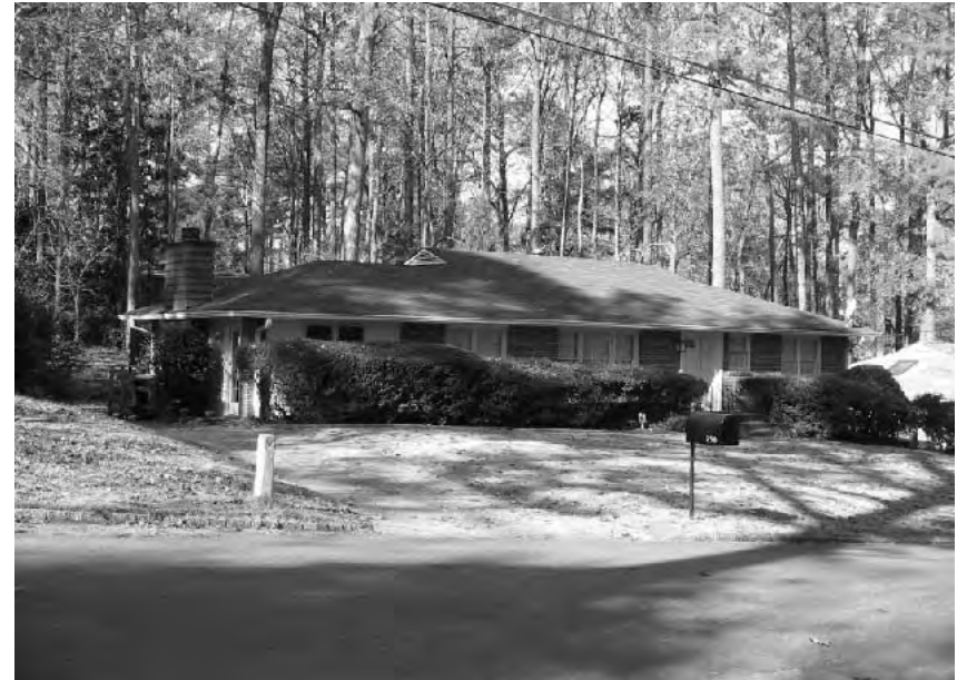
Example of Ranch House type with a low pitched hip roof, Chelsea Circle

Brick veneer exterior, clapboard, masonry accents around entrances and porches. Foundations primarily were built with granite on the Minimal Traditional and some of the earlier Ranch and Cape Cod homes with brick and sometimes cast concrete and concrete block becoming more prevalent in later-built homes.