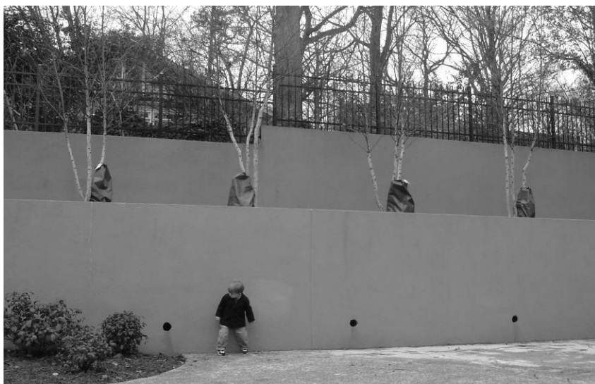
Large retaining wall on new construction that is out of scale with the built environment of Chelsea Heights.