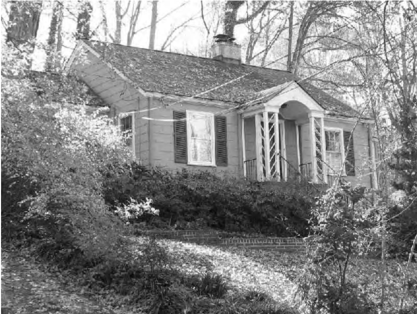
Example of Minimal-Traditional House type with a moderate pitched side gable roof, Chelsea Circle