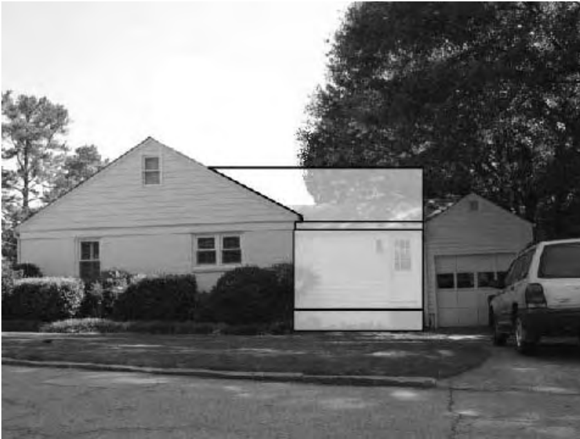
Well conceived addition that would complement the homes original proportions and character.