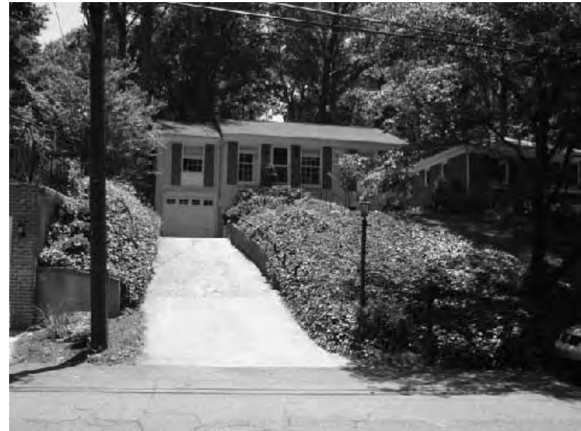
Example of integral front loading garage, Coventry Drive.

Small entrance stoops, are characteristic of the Minimal-Traditional homes while side porches, and distinct rear patios or terraces that contribute to the indoor/outdoor living style of the Ranch house are dominant .