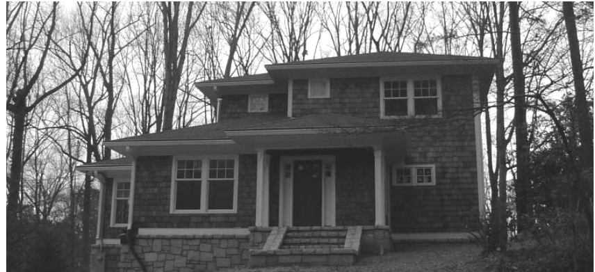
Well executed new construction (2008) in Chelsea Heights subdivision. Horizontal emphasis is maintained by judicious use of a hipped roof. Foundation is low (because of well conceived contour grading) and granite. Multiple architectural elements and roof setbacks avoid a monumental façade. Architectural details are important but minimal.