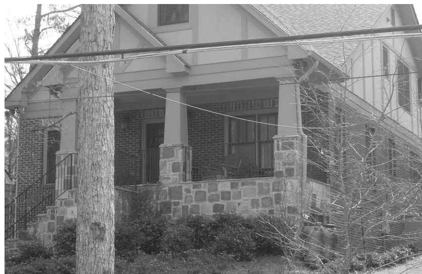
Tall foundation with non-historic materials applied as a façade interjects an arrhythmic element to the typical Chelsea Heights Streetscape.

Guideline — Foundation and retaining wall materials should be limited to brick, concrete block, cast concrete and granite. Application of other materials as a façade should not be allowed if visible from the right of way.