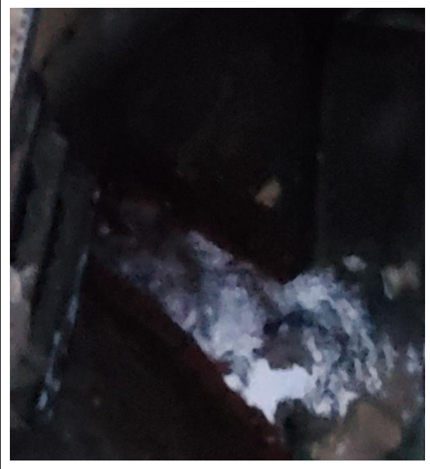
Cityworks Image 20220719_205702 (WO-22061858)

Cityworks WO-22061858 - Evidence of Grease.