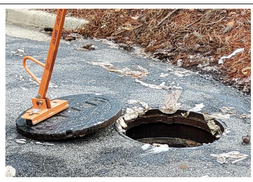
Cityworks Image 20220808_093309 (WO-22071237)

Image of spill aftermath, Contractor C.E.A.M cleaned up debris, Cityworks WO-22071237