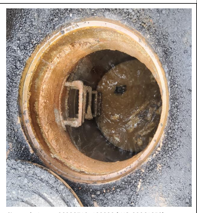
Cityworks Image 20220719_193930 (WO-22061858)