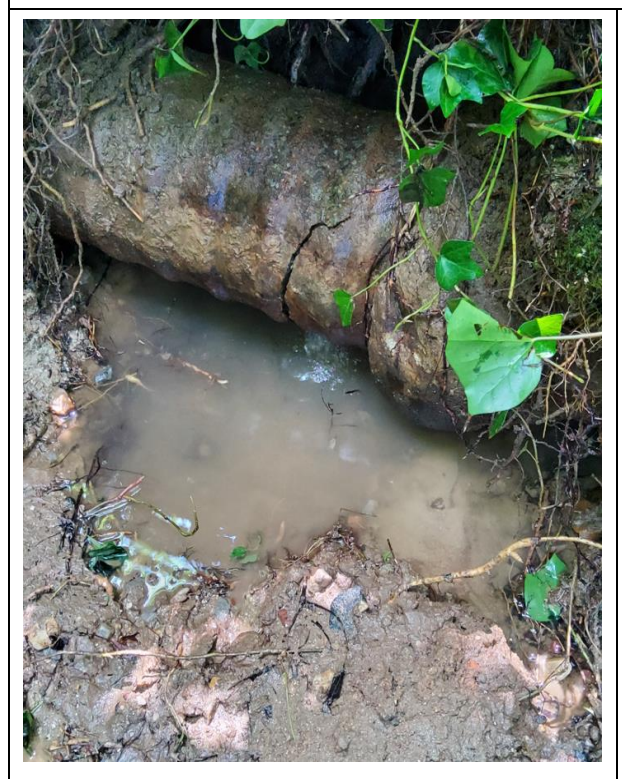
Cityworks Image - 20220807_140902.jpg (WO-22071138)

Image of broken main, Cityworks WO-22071138