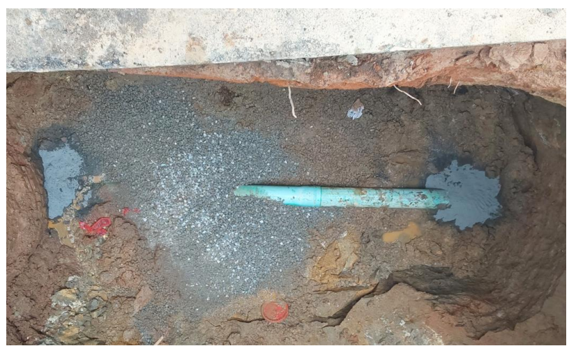
Cityworks Image 20220816_140117 (WO-22072708)

Image pipe repair work at site, Cityworks WO-22072438, WO-22072708