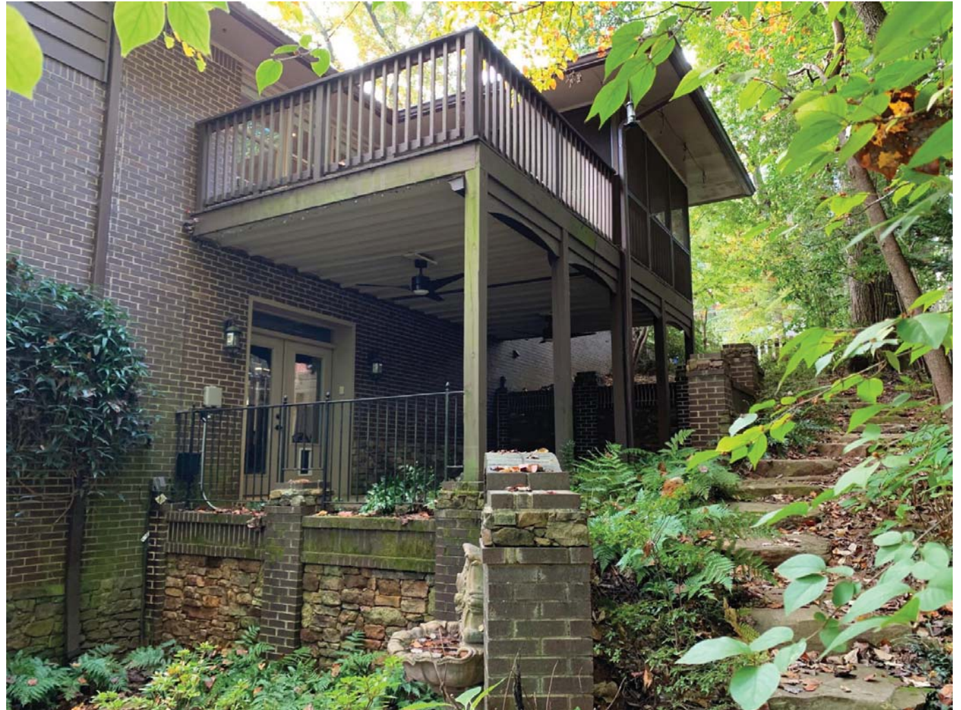
Proposed Exterior Change - 246 Woodview Dr