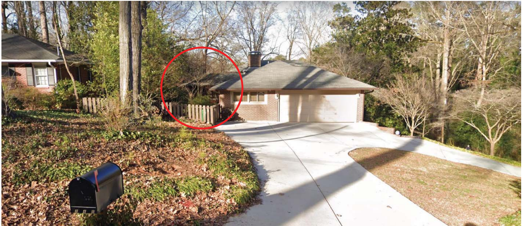
Proposed Exterior Change - 246 Woodview Dr

View from street, looking north. Note slight rise in elevation from street to house, location of west neighbor's house, and location of exterior change underneath screened-in porch (red circle).