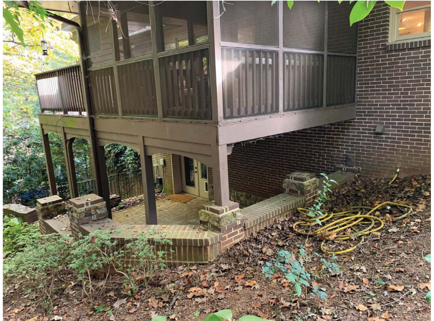
Proposed Exterior Change - 246 Woodview Dr

Note elevation change and retaining wall which secludes visibility from west neighbor, and privacy landscaping shielding view from north neighbor.