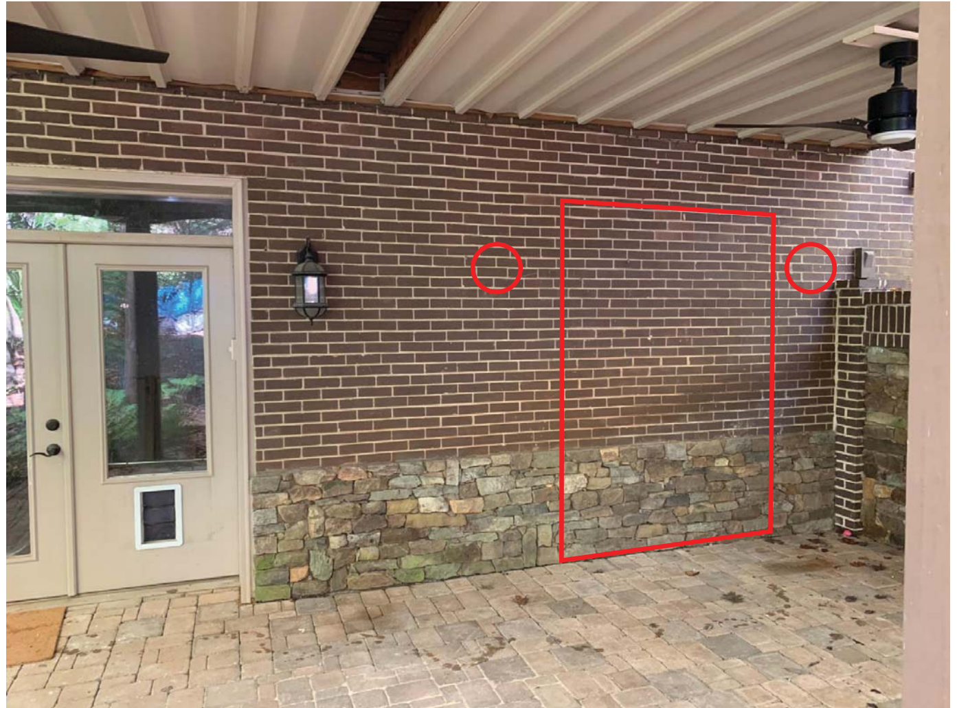
Proposed Exterior Change - 246 Woodview Dr

Locations of proposed light sconces flanking new door to match existing light sconce locations, circled. Existing sconces to be replaced with different style; all sconces will match.