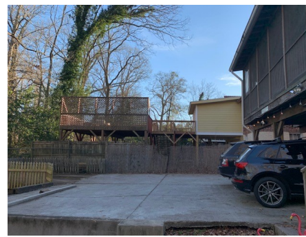
Existing fence left of driveway