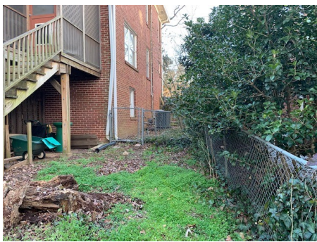
Existing fence right of driveway