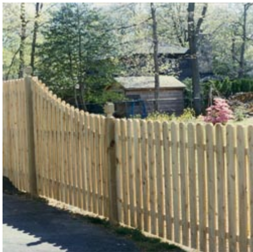
Sample photo of fence transition from 8ft to 6ft