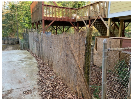
Existing fence left of driveway