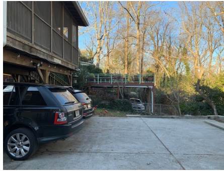
Yard right side of driveway