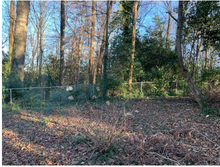
Existing back fence