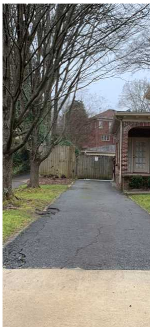
1207 Oxford Rd NE