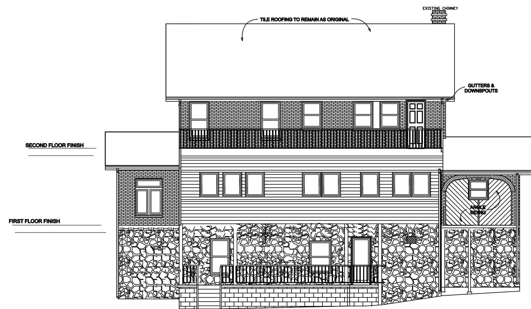
PROPOSED REAR ELEVATION SCALE: 1/8"=1'