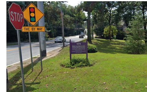
Damaged Sign for Removal

Check, Initial and Date When Proofed: Print / Plot Production Final