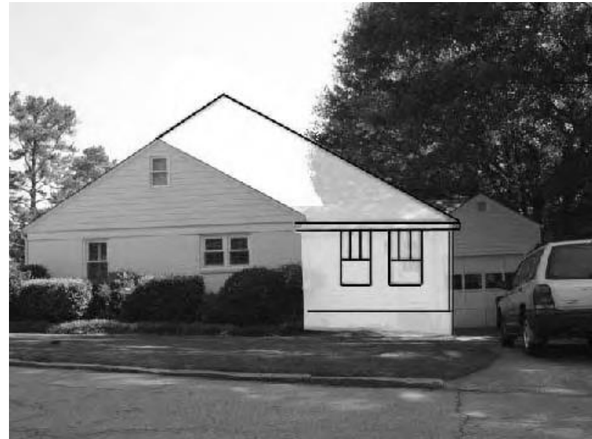
Poorly conceived addition that would mask the homes original proportions and character.

17.9 Recommendation — Place an addition at the rear of a building or set back from the front to minimize the visual impact on the original structure to allow the original proportions and character to remain prominent and to differentiate the old from the new.