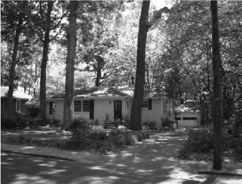
Example of small-scale detached garage to right of house, Dyson Drive.