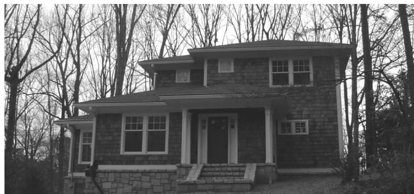
Well executed new construction (2008) in Chelsea Heights subdivision. Horizontal emphasis is maintained by judicious use of a hipped roof. Foundation is low (because of well-conceived contour grading) and granite. Multiple architectural elements and roof setbacks avoid a monumental façade. Architectural details are important but minimal.