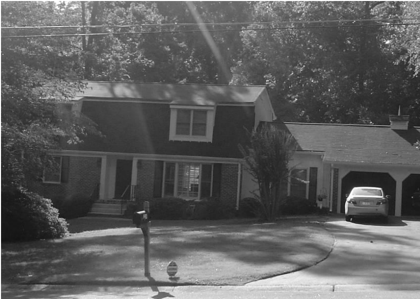
Example of a 2-story home with a strong horizontal orientation or emphasis.