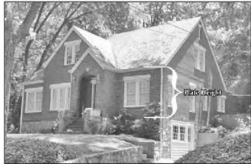
Illustration of plate height— limiting plate height can help decrease the height and massing of new construction and increase the horizontal emphasis of such.

17.3 Recommendation — New construction and additions should have perceived plate heights that are compatible with those of adjacent properties and homes along the street. Ensuring compatible plate heights can address, more specifically, the appropriate scale of new construction than addressing the number of stories alone.