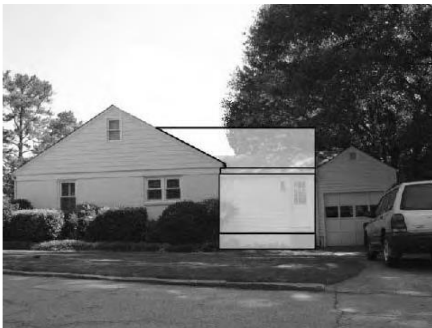
Well-conceived addition that would complement the homes original proportions and character.