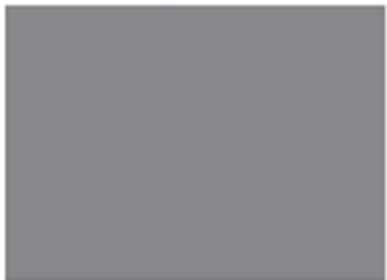
PMS Cool Gray