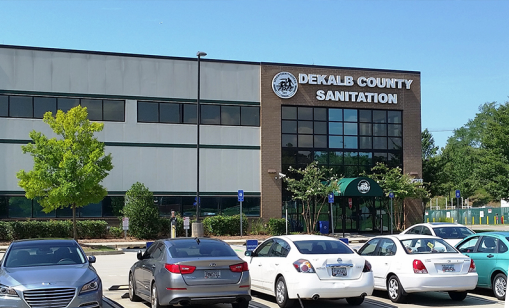
Sanitation Division Administrative Office