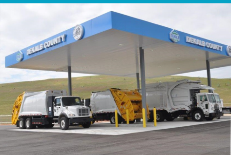
CNG Station – Seminole Road Landfill