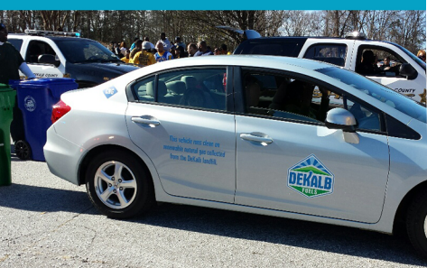
Sanitation Division CNG Fleet