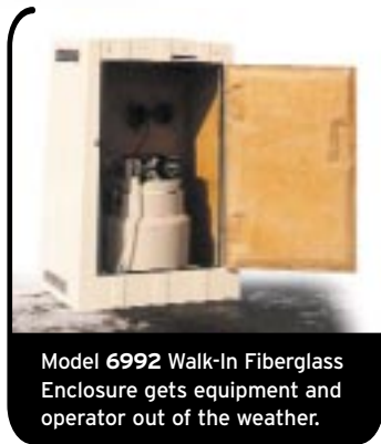
Model 6992 Walk-In Fiberglass Enclosure gets equipment and operator out of the weather.