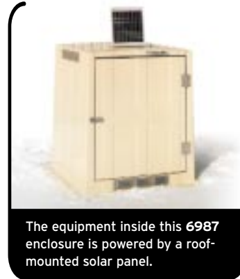
The equipment inside this 6987 enclosure is powered by a roof-mounted solar panel.