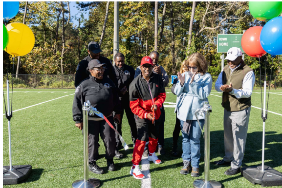
EXCHANGE PARK FIELD RENOVATION RIBBON CUTTING