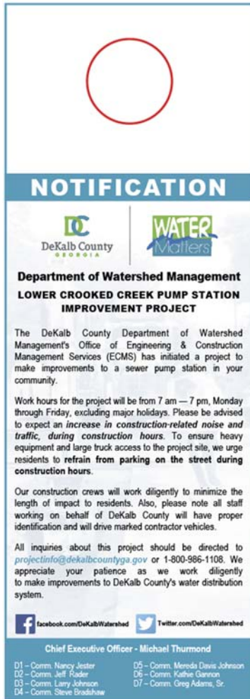
Sample 1. Door Hanger