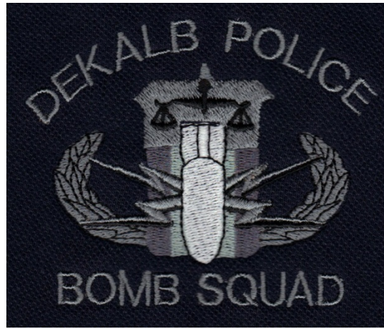
Special Operation Patch