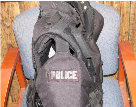
Arm of vest