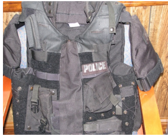
Front of vest