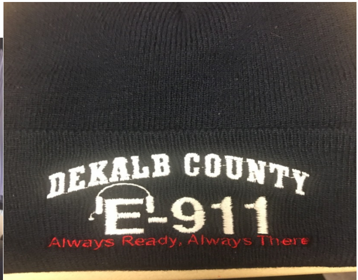
EMBROIDERY FOR KNIT CAPS