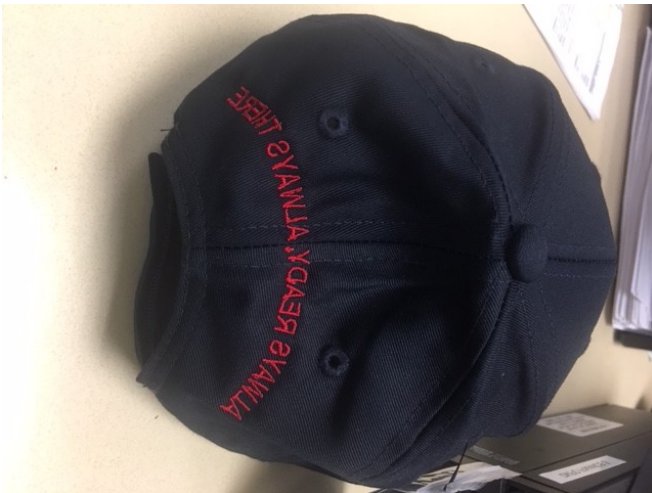
E911 OPERATOR HAT (BACK) EMBROIDERY