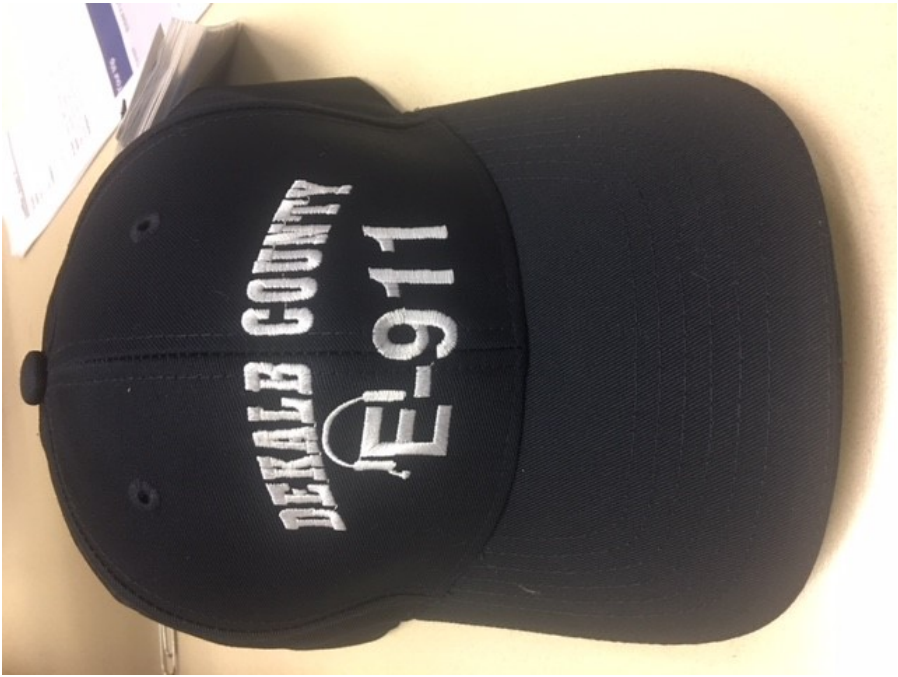
E911 OPERATOR HAT (FRONT) EMBROIDERY