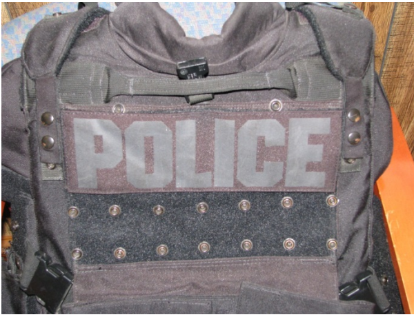
Back of vest