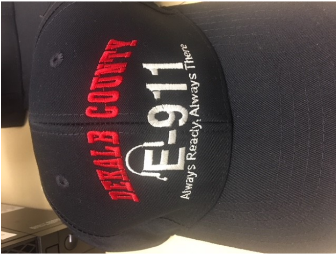
E911 SUPERVISOR HAT (FRONT) EMBROIDERED