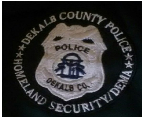
DEMA/Homeland Security- Embroidery name and rank on right chest in Gold and Silver. Embroidery badge on left chest in Gold and Silver