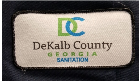
Embroidery and Patch