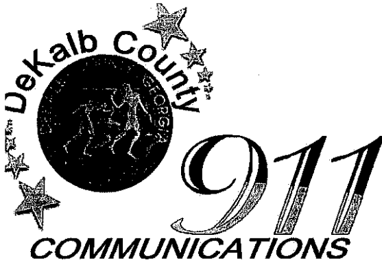
(Gold n White) managers