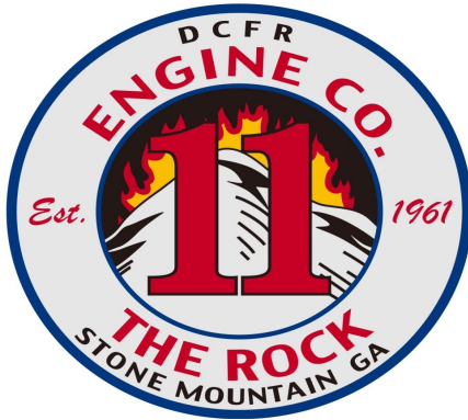
Company 11 The Rock