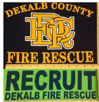
DCFR Scramble T Shirt Back Screenprint