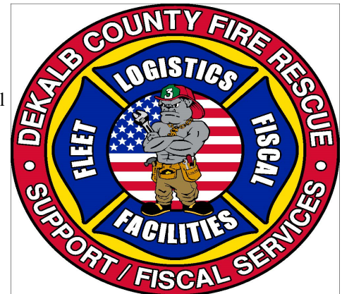
Support / Fiscal Services Division