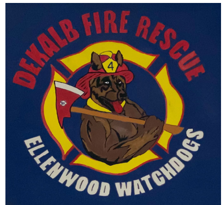
Company 4 Ellenwood Watchdogs