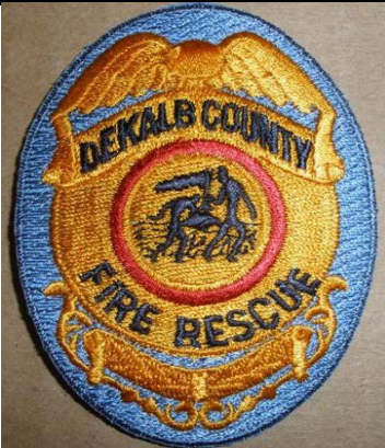
Left Chest Badge for Application, all ranks, Firefighter, Fire Apparatus Operator, Captain, Battalion Chief, Assistant Chief, Deputy Chief, Fire Chief