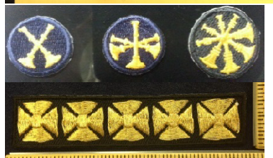
Maltese Cross YOS