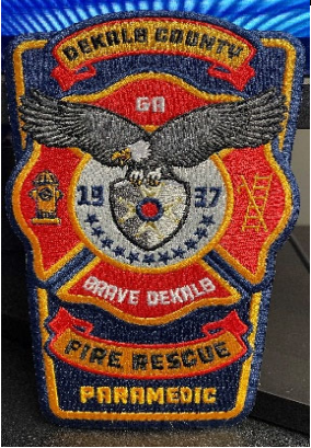
Department Patch for illustration purposes, shall be manufactured with no medical cert, EMT-B, AEMT, Paramedic, and Class A Uniform Gold Thread Patch

Class A Coats will include department patch on left sleeve and company / division patch on right sleeve, rank stripes on both sleeves, years of service Maltese cross on one sleeve.