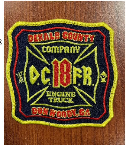
Company 18 Dunwoody Hilton