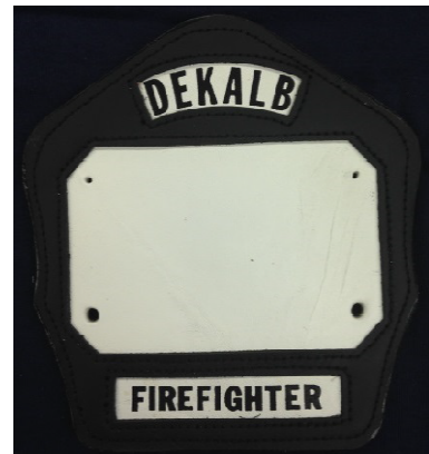
Hanover Leather Fire Helmet Shield (Black)