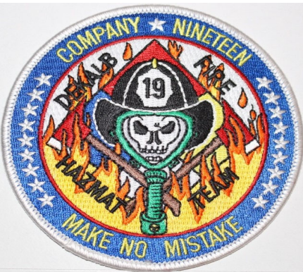
Company 19 Make No Mistake