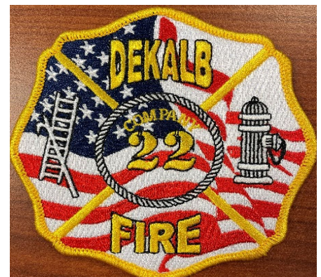
Company 22 Double Deuce