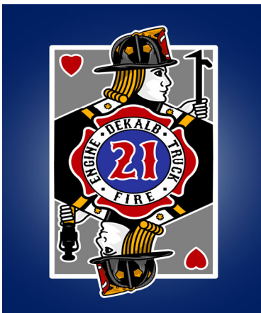
Company 21 Protecting the Perimeter