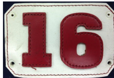
Hanover Leather Fire Helmet Shield Insert (Red)