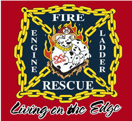
Company 25 Living on the Edge