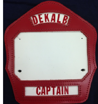
Hanover Leather Fire Helmet Shield (Red)