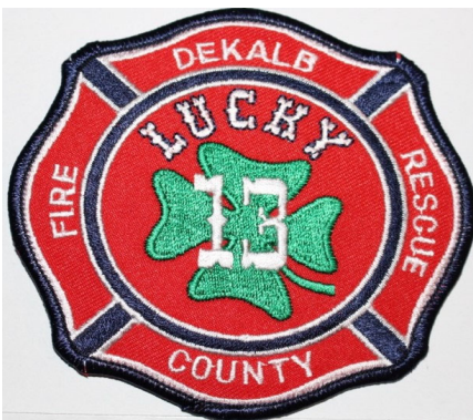
Company 13 Lucky 13