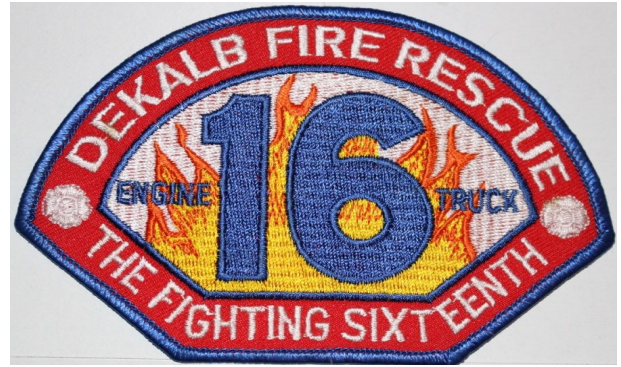
Company 16 The Fighting 16th