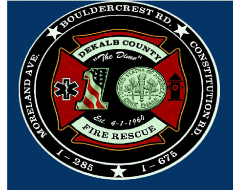
Company 10 The Dime