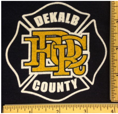
DCFR Scramble T Shirt Chest Logo Screenprint