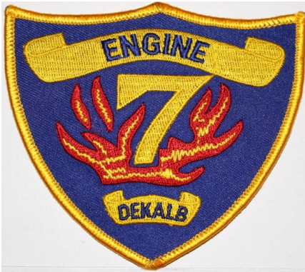
Company 7 War Wagon