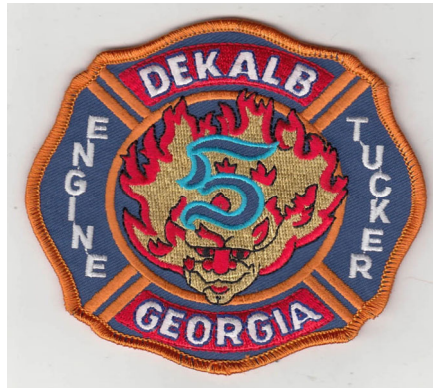
Company 5 Tucker Tigers