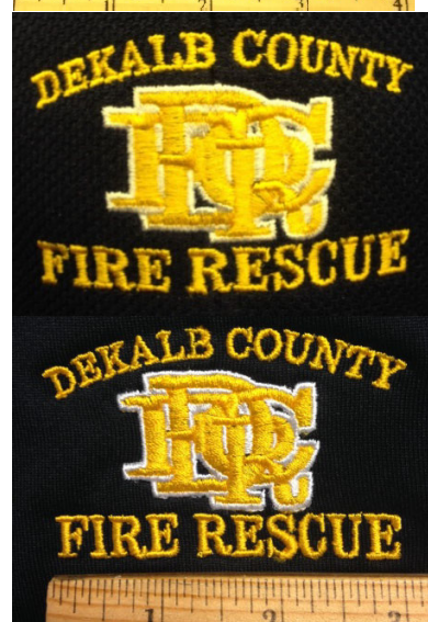
DCFR Scramble Chest / Hat Logo Embroidered