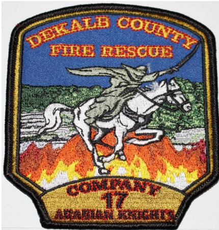
Company 17 Arabian Knights