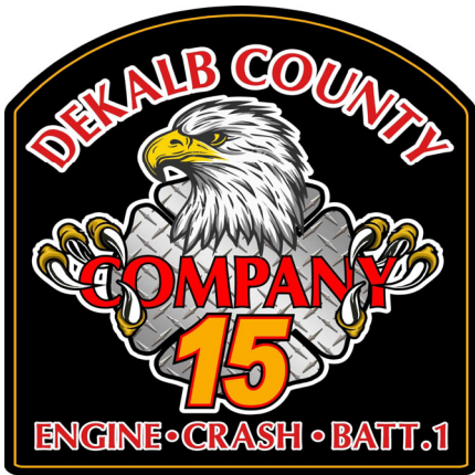
Company 15 Crash Fire Rescue