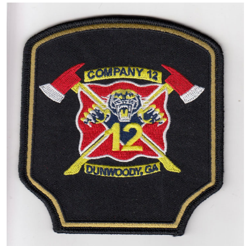
Company 12 Wildcat