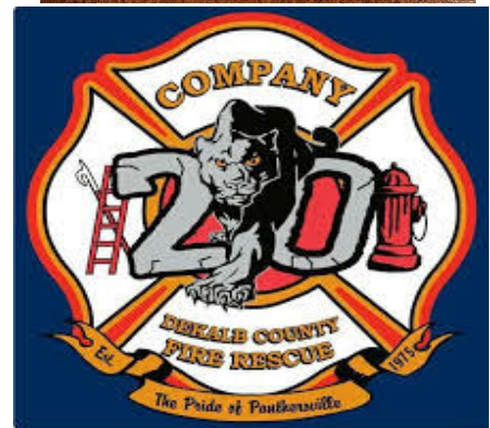
Company 20 Pride of Panthersville