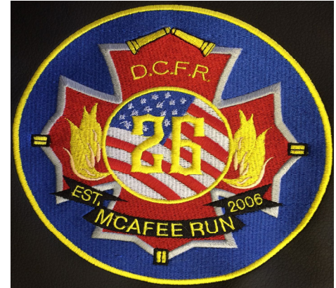
Company 26 McAfee Run