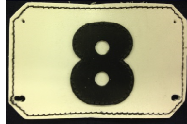
Hanover Leather Fire Helmet Shield Insert (Black)