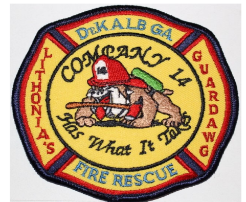
Company 14 Lithonia's Guardawg