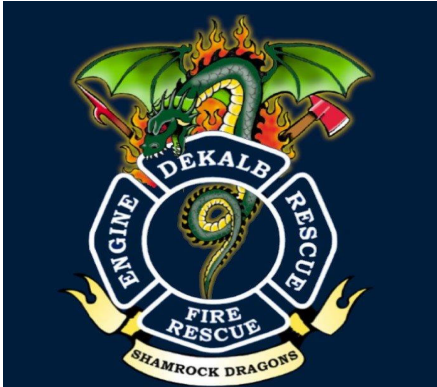
Company 9 Shamrock Dragons