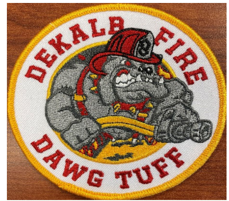
Company 8 Dawg Tuff