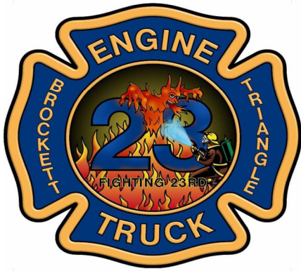
Company 23 The Fighting 23rd