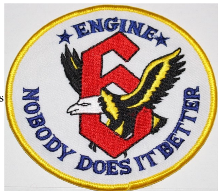
Company 6 Nobody Does It Better