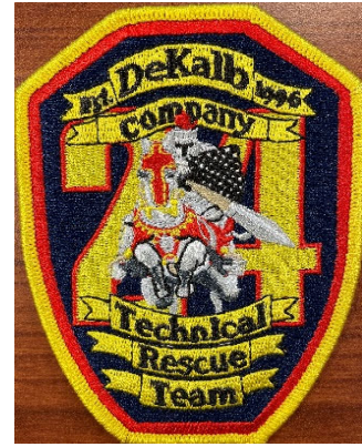
Company 24 Technical Rescue Team