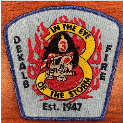
Company 3 In The Eye of The Storm