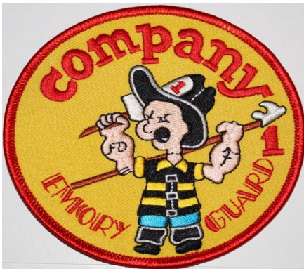
Company 1 Emory Guard