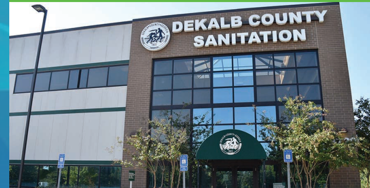
Sanitation Division Administration Building