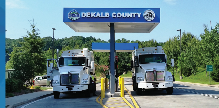
Sanitation Division Public CNG Fueling Station