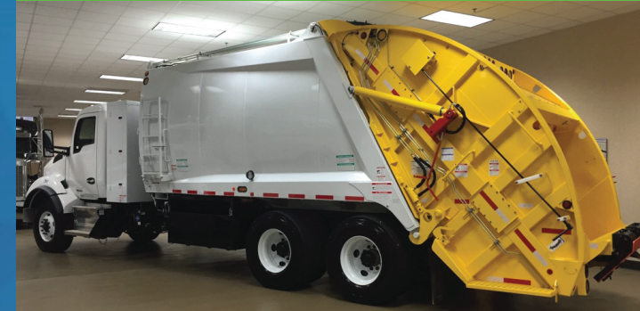
Sanitation Division Residential Rear-loader Truck