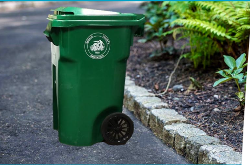
Standard Garbage Roll Cart (65 gallon)