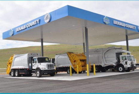
CNG Station – Seminole Road Landfill