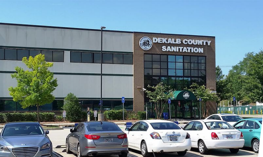
Sanitation Division Administrative Office