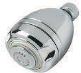
Low-flow shower heads use approximately 2.5 gallons of water per minute.