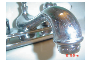
Lavatory faucet (bathroom sink) 2.0 gallons of water per minute or Lavatory faucet replacement aerator.