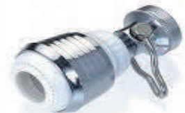
Low-flow faucet aerators use approximately 2.2 gallons of water per minute. (revised 1/1/12)