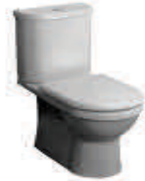
Low-flow toilets use a maximum of 1.6 gallons of water per flush.