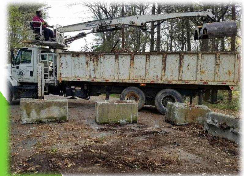
Pictured above is a crew cleaning up North Valleybrook Road and moving our barriers back in place to prevent future dumping.