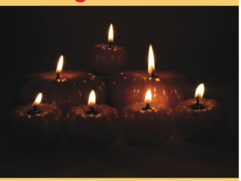
Decorations are the first thing to ignite in 900 reported home fires each year. Two of every five of these fires were started by a candle.