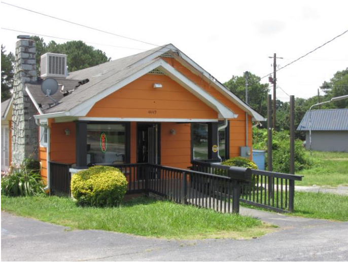
Existing business in front of proposed site on Rockbridge Road.