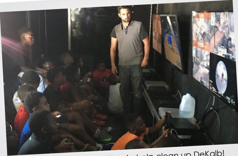
Students working together to help clean up DeKalb!