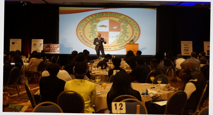
YLA speakers engage the crowd!