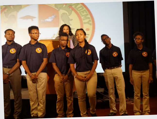
Meet the YLA students!