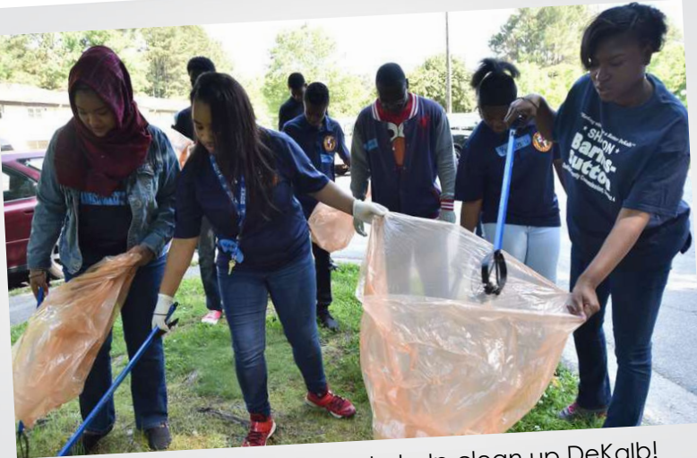
Students working together to help clean up DeKalb!