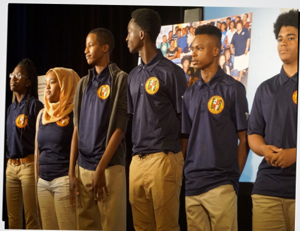
Meet the YLA students!