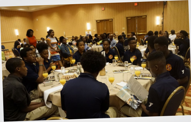
Students and community members at the YLA breakfast