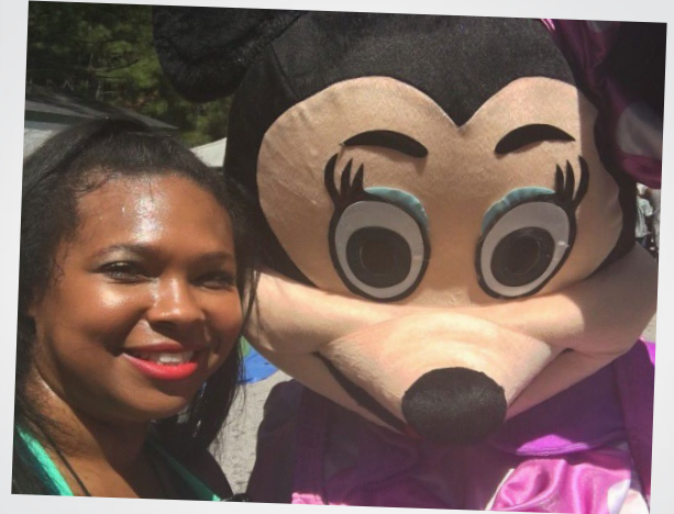
Nothing is too big or too small for this crew!