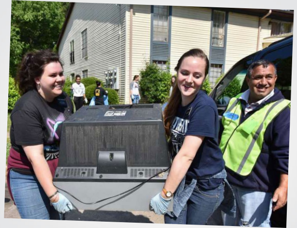
Nothing is too big or too small for this crew!