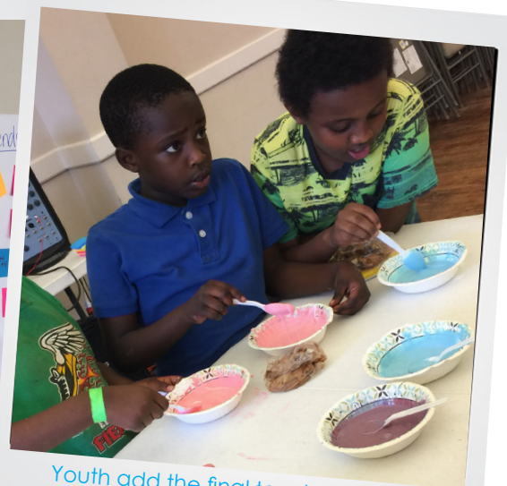
Youth add the final touches to their "feelings slime" and begin to discuss how they will use it to redirect negative feelings.