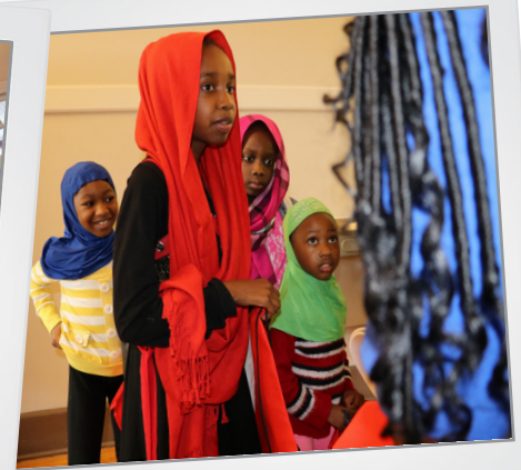
KIDS ARE CURIOUS ABOUT WHAT'S HAPPENING AT THE OYS TABLE!