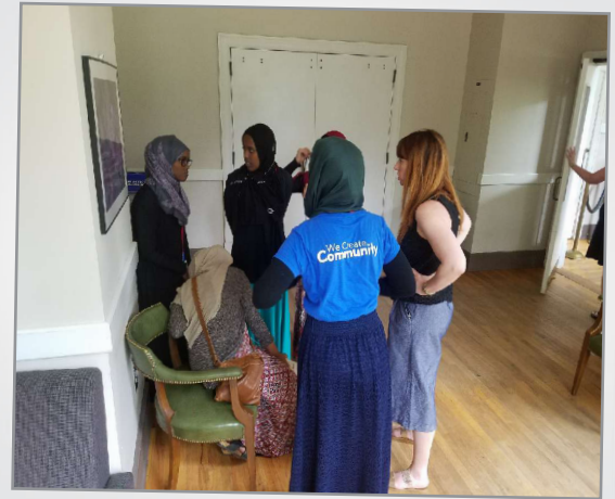
YOUTH DISCUSSING FILM IDEAS!