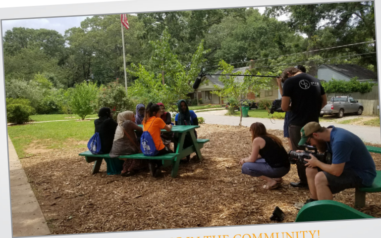
YOUTH FILMING IN THE COMMUNITY!