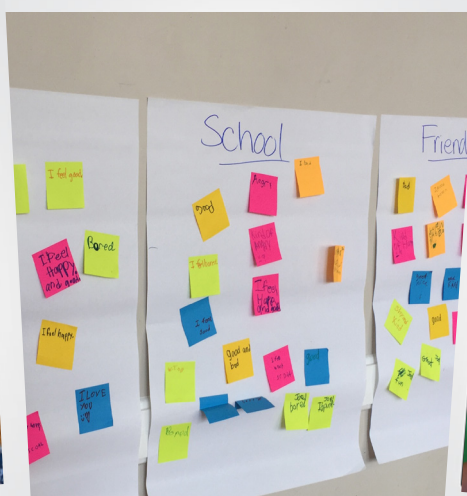
Youth share their thoughts, feelings, and reactions to family, school, and friends!