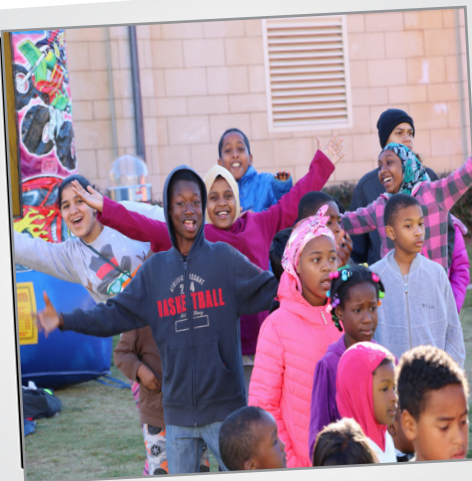
YOUTH ARE EXCITED TO BE AT SAFE KIDS BIKE RODEO!