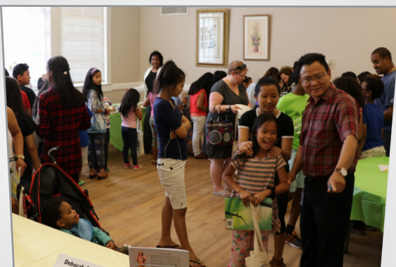
THE COMMUNITY COMES TOGETHER TO PROMOTE READING & ARTS!