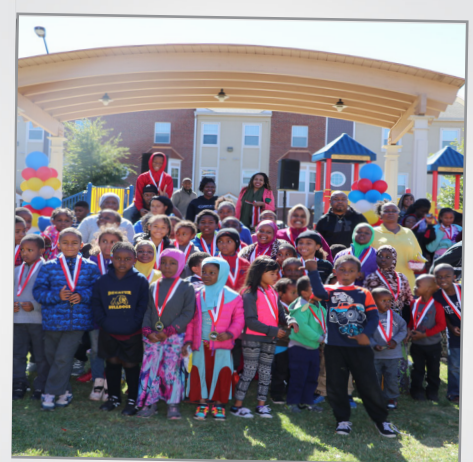
YOUTH RECEIVED AN AWARD FOR PARTICIPATING IN SAFE KIDS BIKE RODEO!