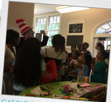
CAT IN THE HAT STOPS BY THE OYS TABLE TO LAUGH WITH KIDS!