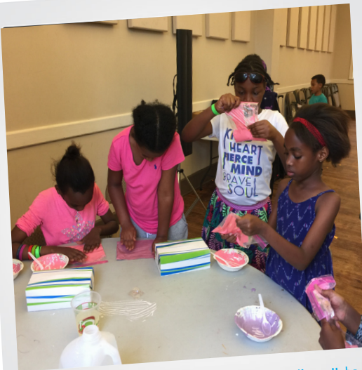
Youth work on making "feelings slime" to help redirect negative thoughts, feelings and behaviors!

Project One80 offers youth ages 6-12 a safe and constructive place to express themselves and begin developing effective coping skills to manage the obstacles they face as growing adolescents. At Project One80 the main goal is to enable youth to reach their full potential as productive, responsible, and caring citizens of DeKalb County. We reach this goal through exercises focused on challenging current mental health practices and promoting healthy emotional, physical, and mental development. This summer, Project One80 successfully launched a mental health and wellness component to the STEAM Summer Camp at Clarkston Community Center. Over 70 youth, ages 6-12, had the exciting opportunity to met with specialized professionals on a weekly basis to discuss and learn about, personal development, life skills, positive attitudes, behavior changes, character development, and healthy emotional management. Youth also participated in fieldtrips, therapeutic art projects, and small group positive action activities!