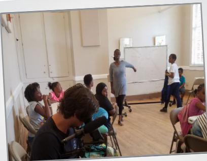
LEARNING THE BASICS!