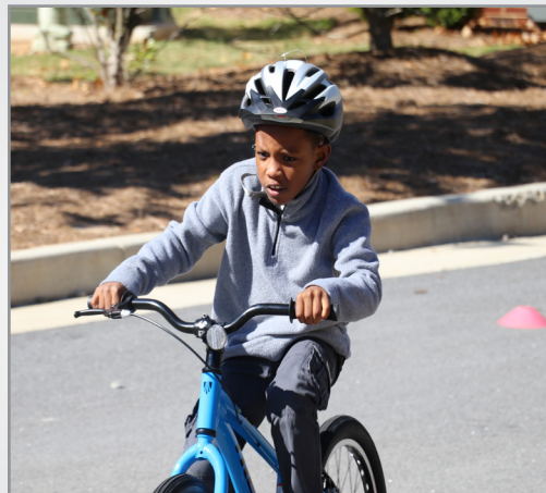
HE'S GIVING HIS BEST ATTEMPT TO FINISH THE BIKE COURSE!