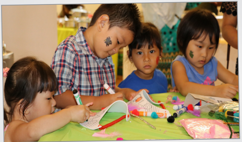
YOUTH DESIGN SUN VISORS AT THE OYS TABLE!