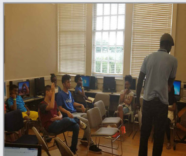
YOUTH DISCUSSING NEW WAYS TO BRING IDEAS TO LIFE!