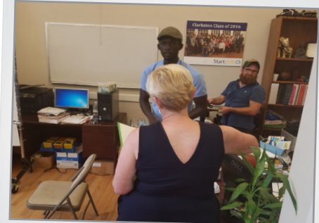
PREPARING TO MAKE D2BAWARE AMAZING!