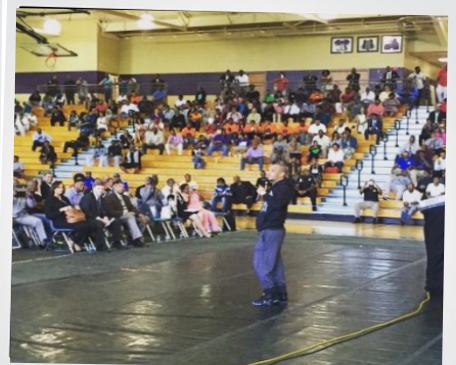
TI ADDRESSING THE CROWD