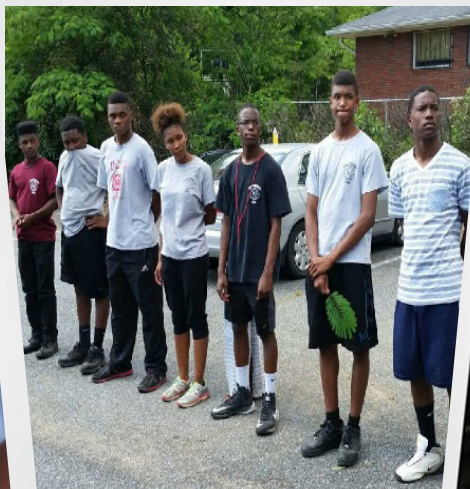
Explorers preparing to begin their day of mission work!