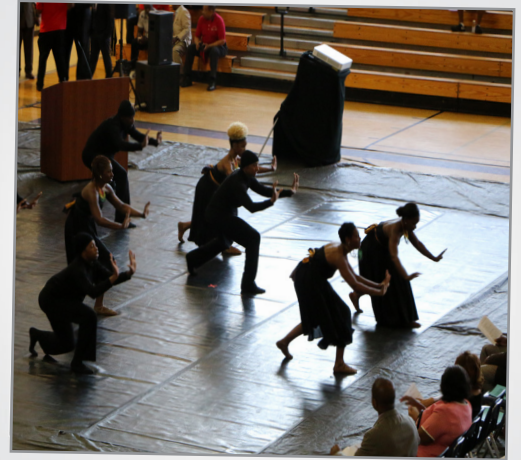
DANCE TROOP PERFORMING