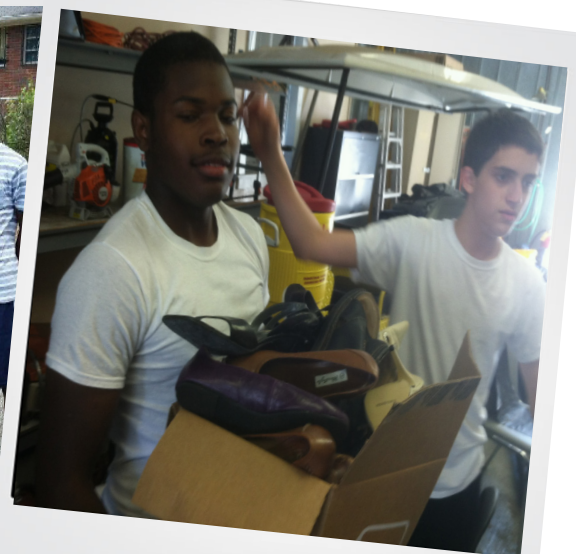
Explorers separate shoe sizes!