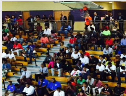
HUNDREDS OF YOUTH IN ATTENDANCE