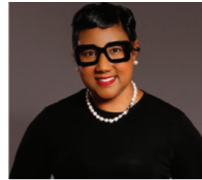
District 7 Commissioner Lorraine Cochran-Johnson