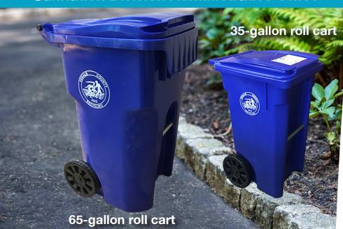
Recycling Container Options