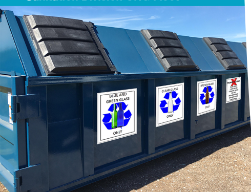
Glass Recycling Program