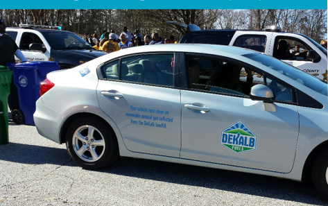
Sanitation Division CNG Fleet