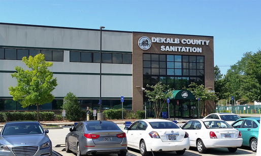
Sanitation Division Administrative Office