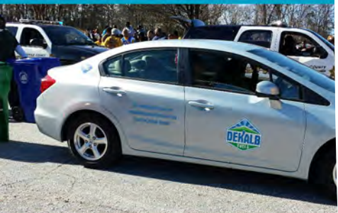
Sanitation Division CNG Fleet