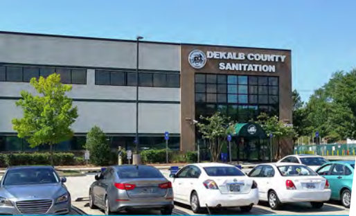
Sanitation Division Administrative Office