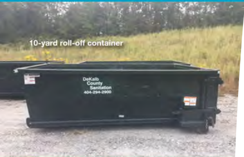
10-yard roll-off container