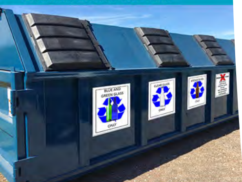
Glass Recycling Program