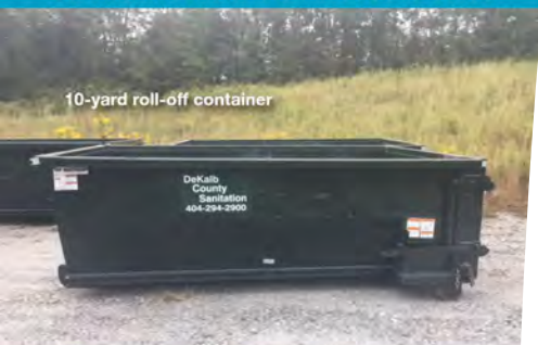
10-yard roll-off container