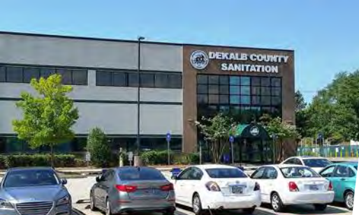
Sanitation Division Administrative Office