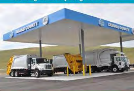
CNG Station – Seminole Road Landfill