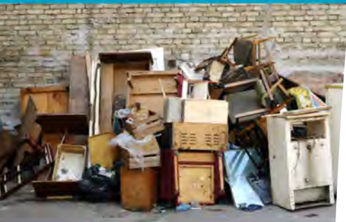
Special Collections Items