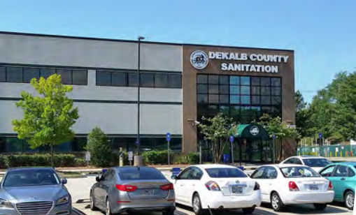
Sanitation Division Administrative Office