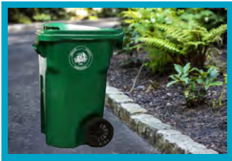
95-gallon garbage roll cart

Minimum collection frequency of once per week is required $75 container delivery fee, $75 container removal fee, and first month's service fee must be paid prior to receiving container