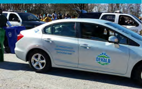
Sanitation Division CNG Fleet