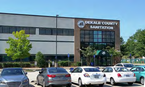
Sanitation Division Administrative Office