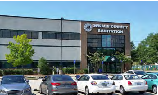
Sanitation Division Administrative Office