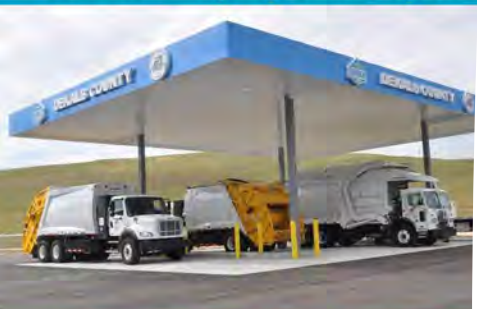
CNG Station – Seminole Road Landfill