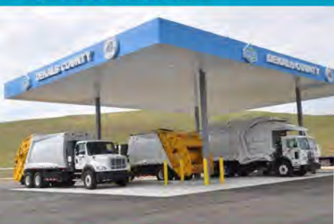
CNG Station – Seminole Road Landfill