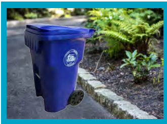
65-gallon recycling roll cart

*Applies to minimum non-container commercial hand-collection service OR two 95-gallon garbage roll carts For requests beyond three roll carts, a commercial dumpster or roll-off container will be required