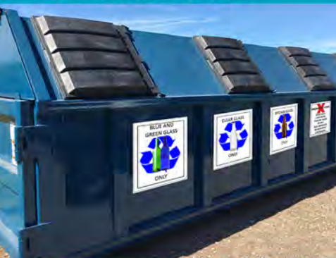
Glass Recycling Program