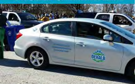
Sanitation Division CNG Fleet