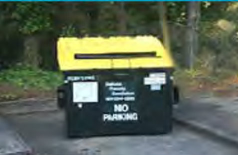
Commercial Recycling Container Option