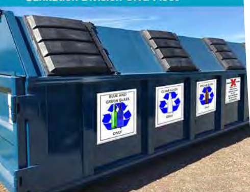
Glass Recycling Program