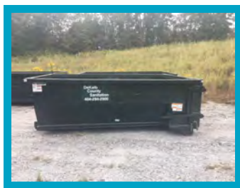
10-yard roll-off container