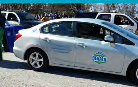
Sanitation Division CNG Fleet