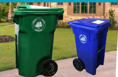
Garbage or Recycling Roll Cart