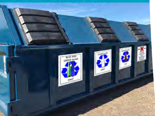
Glass Recycling Program