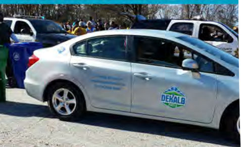
Sanitation Division CNG Fleet