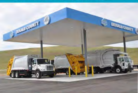
CNG Station – Seminole Road Landfill