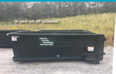
10-yard roll-off container