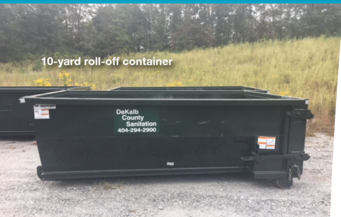
10-yard roll-off container