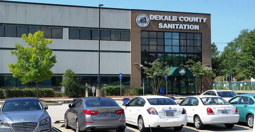
Sanitation Division Administrative Office