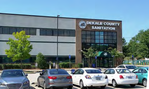
Sanitation Division Administrative Office