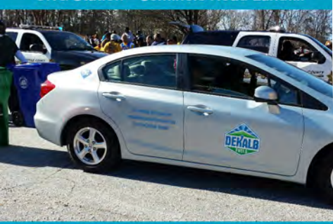
Sanitation Division CNG Fleet