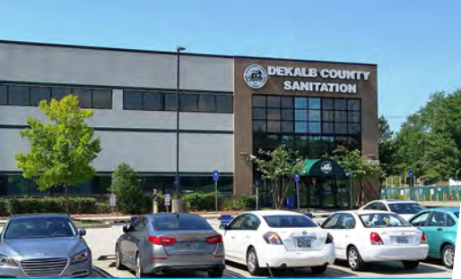
Sanitation Division Administrative Office