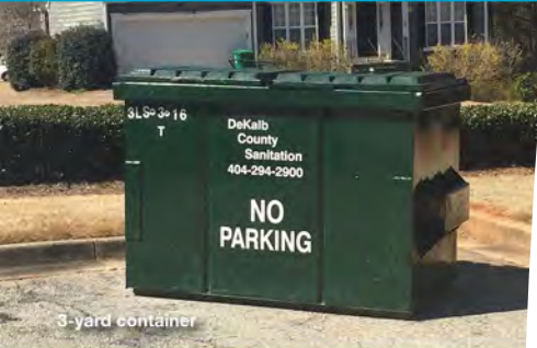
Commercial Garbage Dumpster