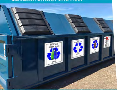
Glass Recycling Program