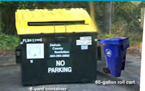
Commercial Recycling Container Options