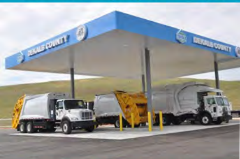
CNG Station – Seminole Road Landfill