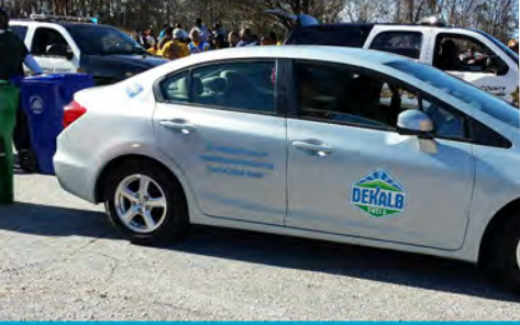
Sanitation Division CNG Fleet