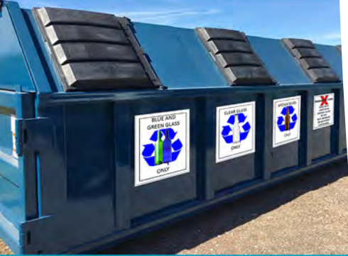
Glass Recycling Program