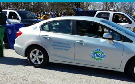
Sanitation Division CNG Fleet