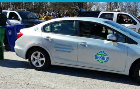
Sanitation Division CNG Fleet