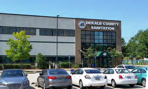
Sanitation Division Administrative Office