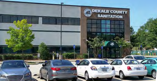
Sanitation Division Administrative Office