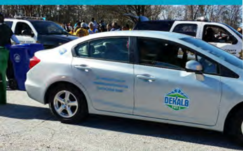
Sanitation Division CNG Fleet