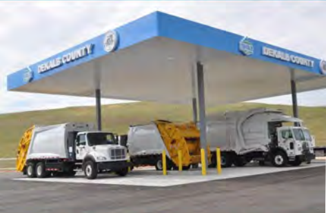
CNG Station – Seminole Road Landfill