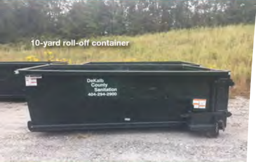
10-yard roll-off container