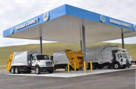
CNG Station – Seminole Road Landfill