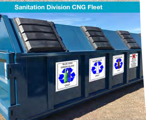
Sanitation Division CNG Fleet