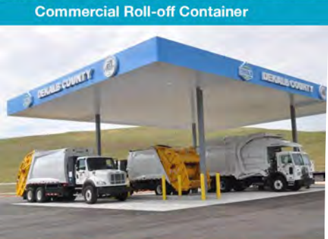
Commercial Roll-off Container