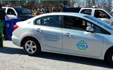
Sanitation Division CNG Fleet