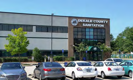
Sanitation Division Administrative Office