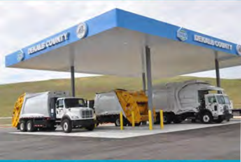
CNG Station – Seminole Road Landfill