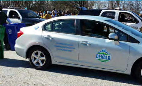
Sanitation Division CNG Fleet