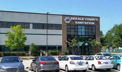
Sanitation Division Administrative Office