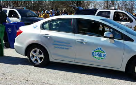
Sanitation Division CNG Fleet