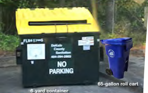
Commercial Recycling Container Options