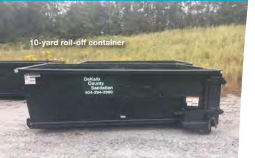
10-yard roll-off container