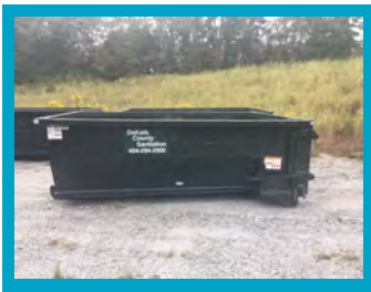
10-yard roll-off container