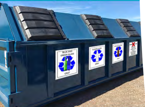
Glass Recycling Program