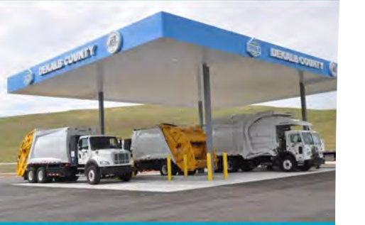
CNG Station – Seminole Road Landfill