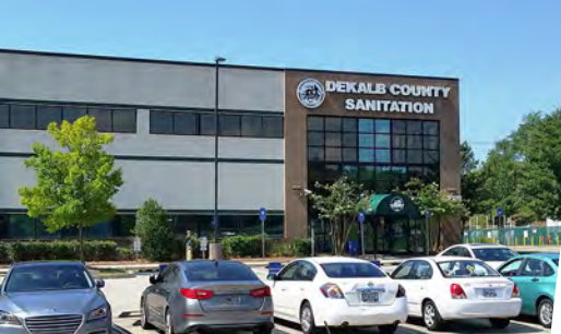
Sanitation Division Administrative Office