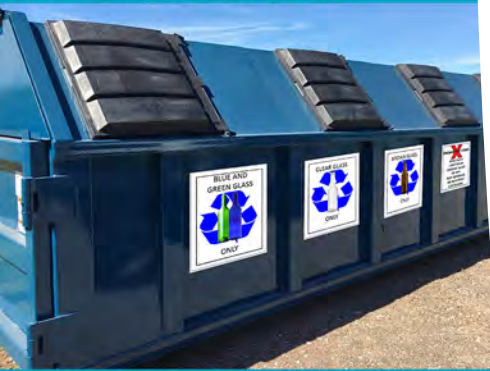
Glass Recycling Program