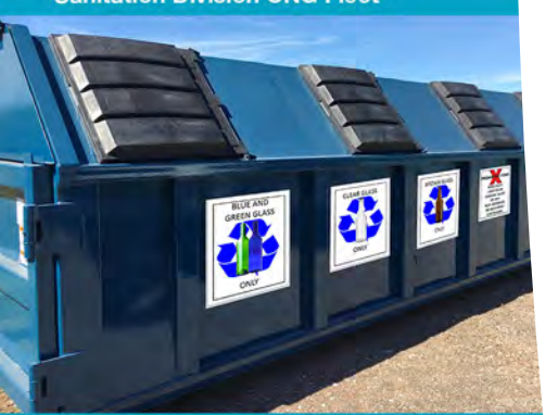
Glass Recycling Program