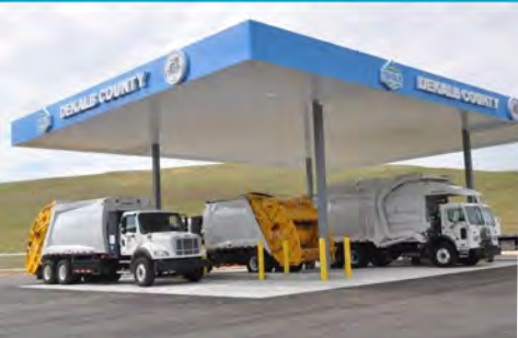
CNG Station – Seminole Road Landfill