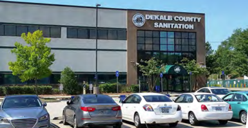
Sanitation Division Administrative Office