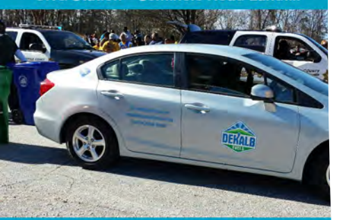
Sanitation Division CNG Fleet