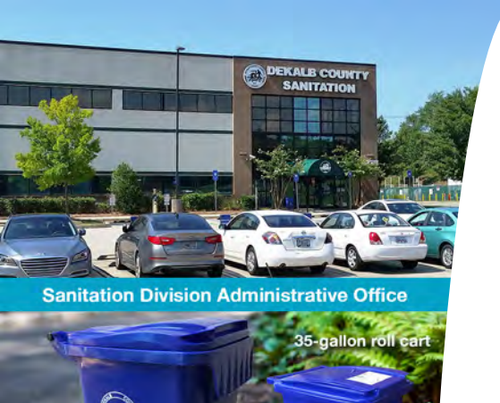
Recycling Container Options