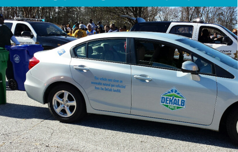
Sanitation Division CNG Fleet