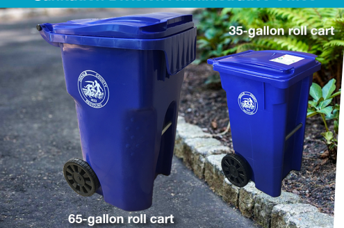
Recycling Container Options