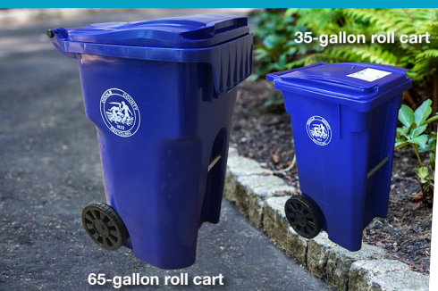
35-gallon roll cart