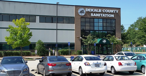
Sanitation Division Administrative Office