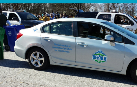
Sanitation Division CNG Fleet