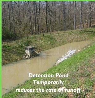
Detention Pond Temporarily reduces the rate of runoff