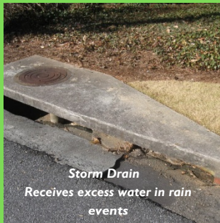
Storm Drain Receives excess water in rain events