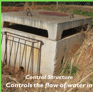
Control Structure Controls the flow of water in designated areas