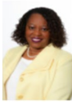
DeKalb County Board of Commissioners