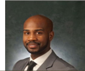
DeKalb Long Range Planning