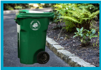
95-gallon garbage roll cart