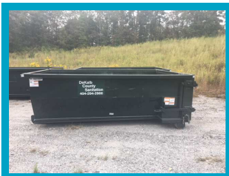
10-yard roll-off container