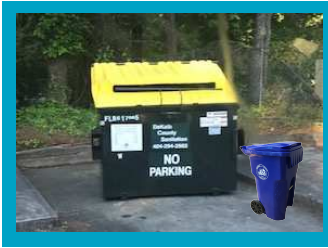
6-yard recycling container and 65-gallon recycling roll cart

For requests beyond four roll carts, a dumpster or roll-off container will be required