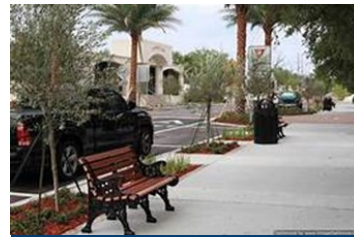
Pedestrian Friendly Design