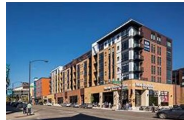
Expanding Mixed Use