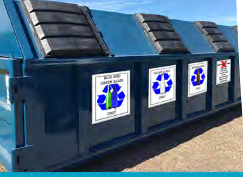
Glass Recycling Program

Customized Commercial Recycling Programs