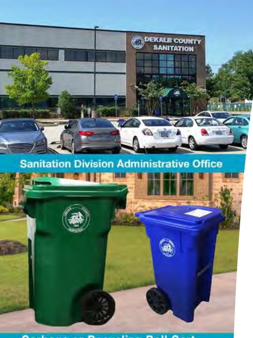
Garbage or Recycling Roll Cart