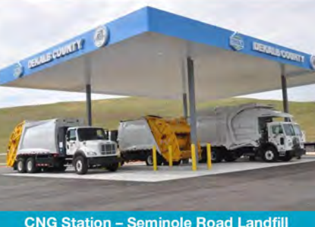
CNG Station - Seminole Road Landfill