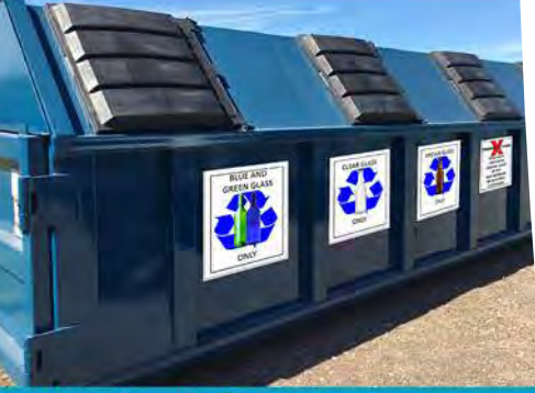
Glass Recycling Program

Customized Commercial Recycling Programs