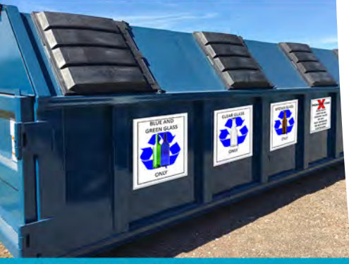
Glass Recycling Program

Customized Commercial Recycling Programs