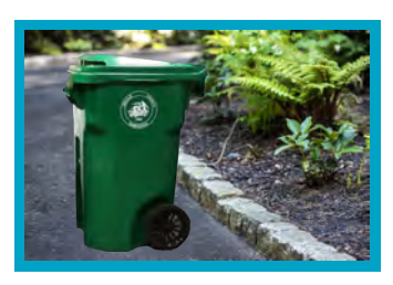
95-gallon garbage roll cart