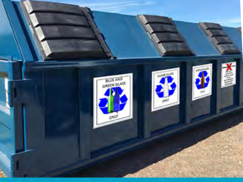
Glass Recycling Program

Customized Commercial Recycling Programs