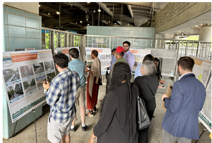
Indian Creek TOD Community Workshop, May 11th, 2023

On May 11th, 2023, MARTA hosted a community workshop that invited the public to influence the master plan and provide input in an open house format.