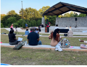
District 3 Town Hall Meeting