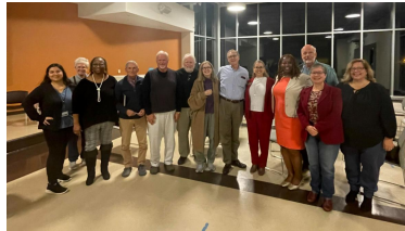
Civic Associations Network