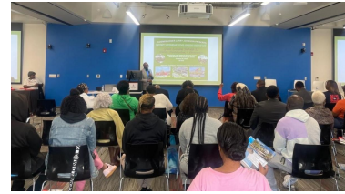
District 3 Economic Development Breakfast