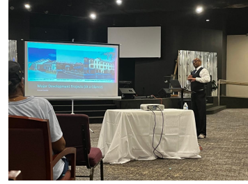
Towers Community Meeting