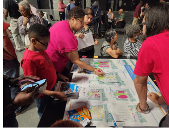
Indian Creek Station Area Design Charette