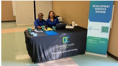
Mobile Permitting Pop-Up