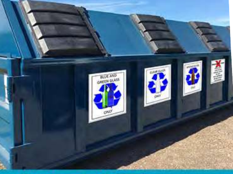
Glass Recycling Program

Customized Commercial Recycling Programs