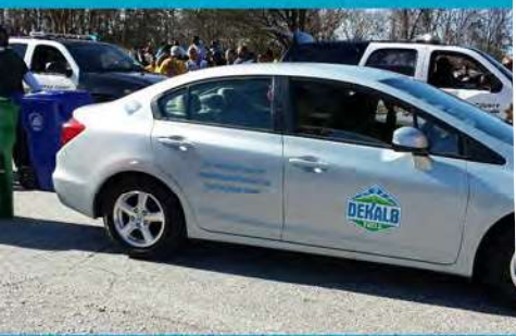
Sanitation Division CNG Fleet