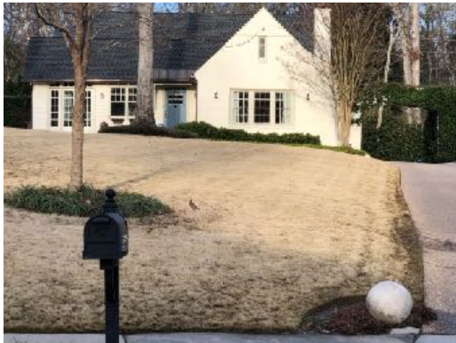
1236 Springdale Road