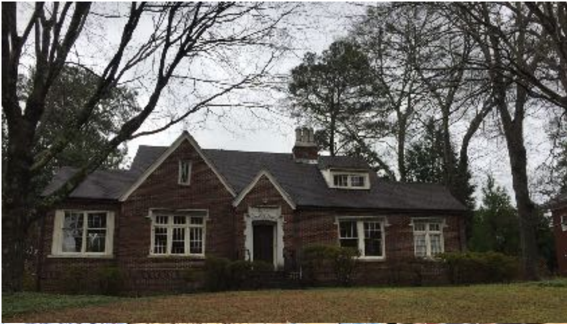
Subject Property 1117 Oxford Road