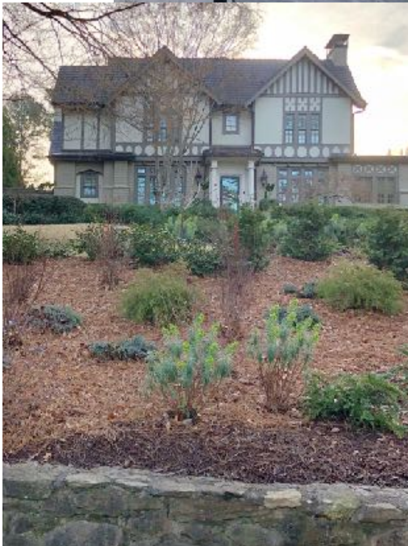
1021 Oakdale Road