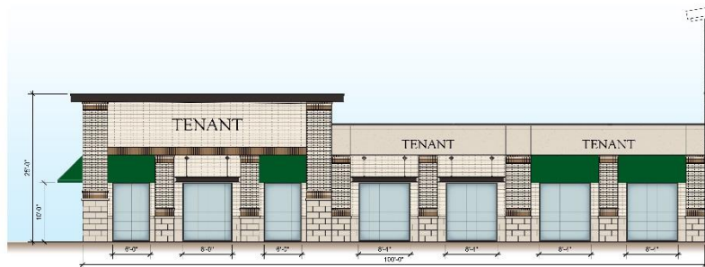
B PARTIAL ENLARGED ELEVATION SCALE: 1/8" = 1'-0"