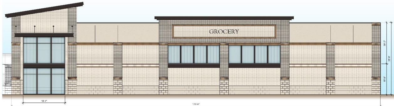
C PARTIAL ENLARGED ELEVATION SCALE: 1/8" = 1'-0"

Proposed Primary Materials: Brick, Architectural Concrete Block, Glass