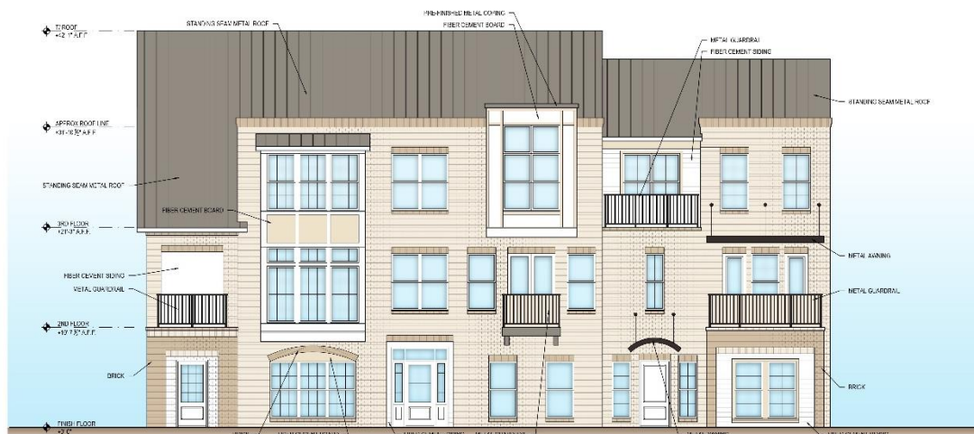
A TOWNHOME FRONT ELEVATION A - 2 CAR SCALE: 3/16" = 1'-0"

ELEVATION ZONING COMPLIANCE DATA: ARTICLE 5